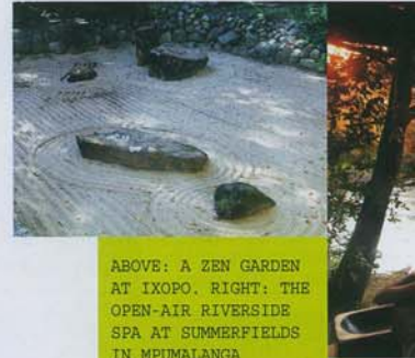
ABOVE: A ZEN GARDEN AT IXOPO. RIGHT: THE OPEN-AIR RIVERSIDE SPA AT SUMMERFIELDS IN MPUMALANGA

The luxuriously appointed tented suites, set beneath a forest of Jackalberry and Tambotie trees, offer all the trappings of an ultra high-end lodge – fluffy white bath gowns, home-baked biscuits, chocolates on the pillows of folded-down beds, and iPods with playlists to accommodate all tastes. (Though my musical preferences naturally tend towards Muse and Franz Ferdinand, while I was at